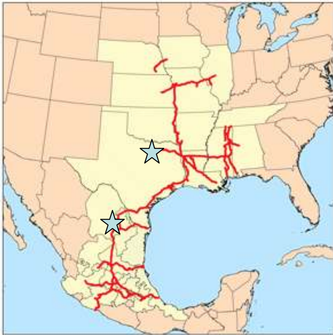
KCS rail map